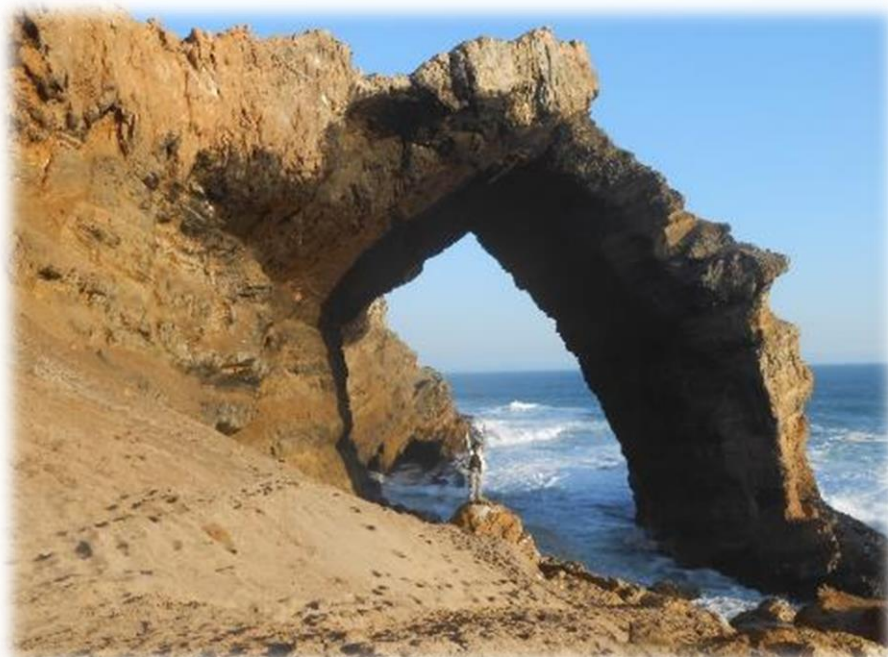
Bogenfels Rock Arch, a 55 metre-high rock arch situated on the coast between Lüderitz and Oranjemund, Karas Region, Namibia