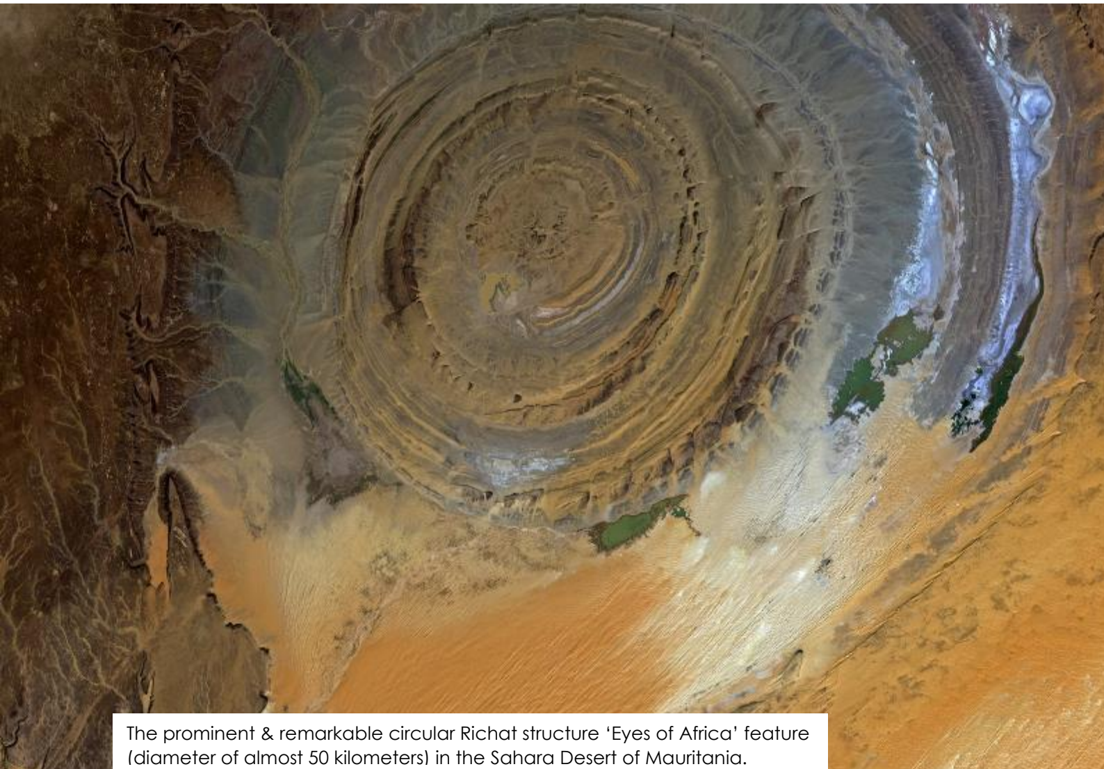
The prominent & remarkable circular Richat structure 'Eyes of Africa' feature (diameter of almost 50 kilometers) in the Sahara Desert of Mauritania.