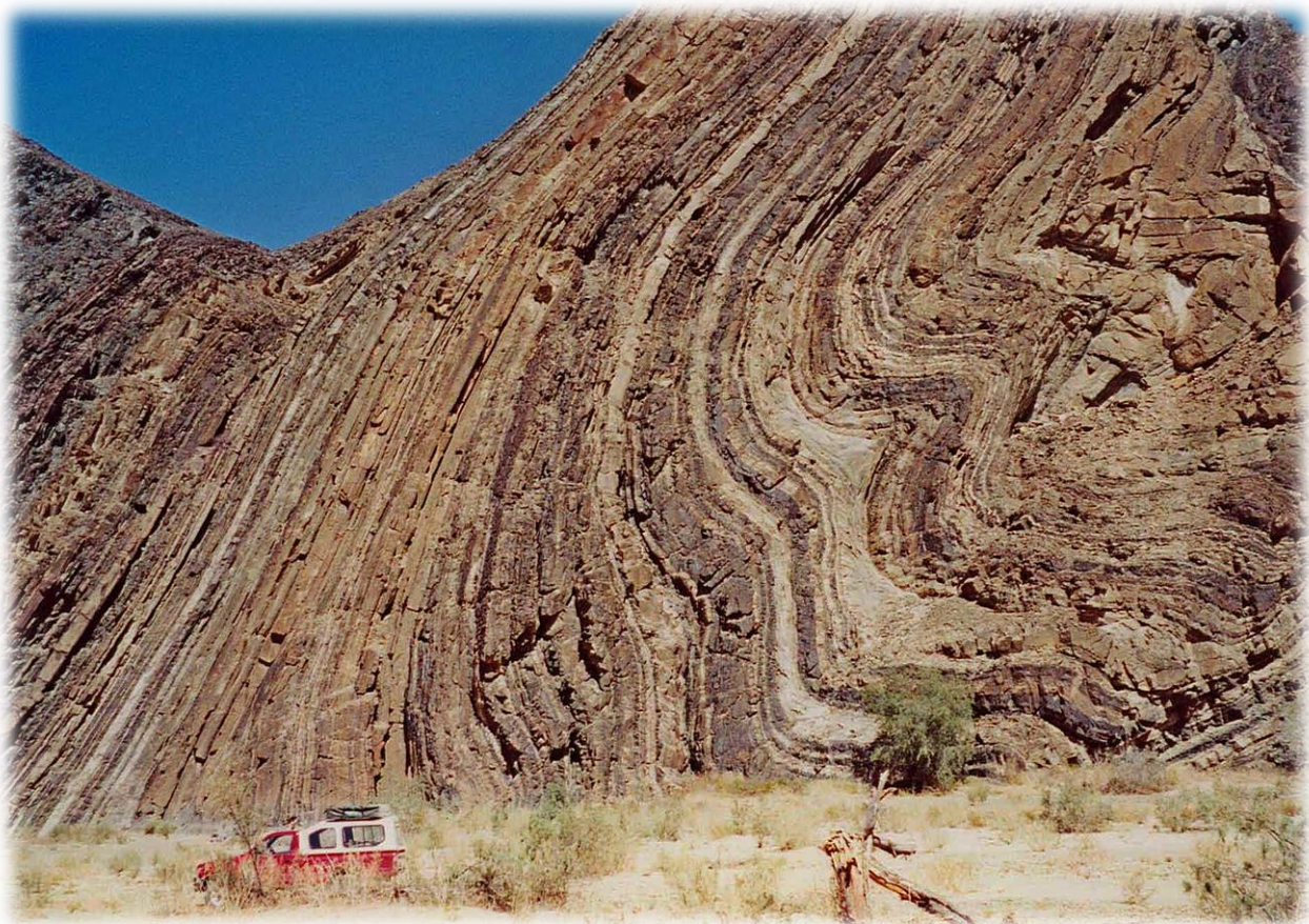
Folded Schist and Marble (Pan-African Damara Orogenic belt) in the Ugab Valley, Namibia)

With the inspiring theme “The earth sciences and Africa’s development: current realities, future projections”, CAG29 will be held at the Safari Hotel Conference Centre, Windhoek, from September 26 th to 29 th , 2023. At this stage of the organization, the LOC is calling for abstracts, as well as proposals of sessions and conveners, workshops, short courses, exhibitions, and more field trips. The Second Circular, to be released by 31 March 2023 , will give details of the Colloquium’s scheduled activities.